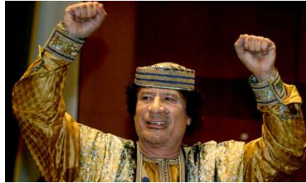
We, we, we... so excited.

but Gaddafi felt that hair dye was a more effective use of the technology. "In addition to the surprising BANG of the color missile detonating just above their head, my clients are amazed by the BANG that their new style gives their personality!"