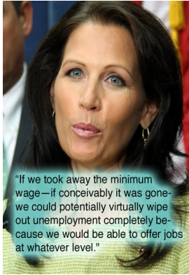
"If we took away the minimum wage—if conceivably it was gone—we could potentially virtually wipe out unemployment completely because we would be able to offer jobs at whatever level."

In the letters, Machelman noted that the current president might be skepti-